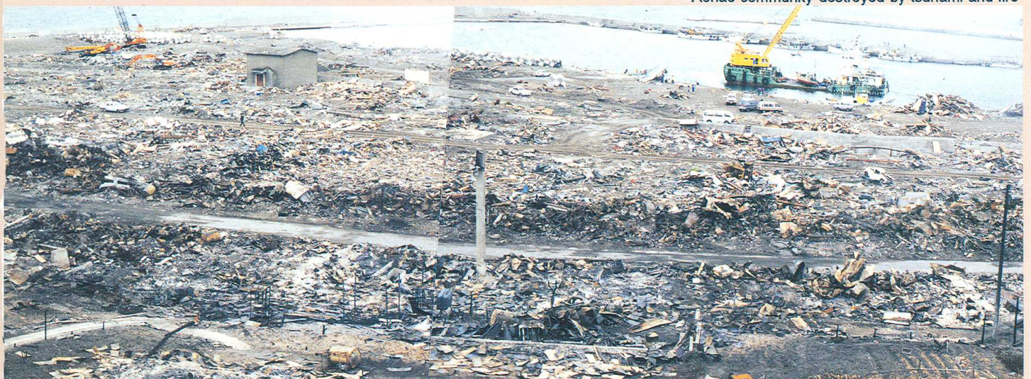
Aonae community destroyed by tsunami and fire

The first attack of tsunami which was 10 m high, arrived from the west around five minutes after the shock. Most of the houses built on the south end of Aonae community were washed away and destroyed in an instant (photo right). The second surge coming along the east coast attacked the most densely built-up area on the east block of Aonae around eight minutes after the shock. The port break-seas guarding the centre part of the built-up area seemed to be effective in mitigating the force of the tsunami. Approximately 200 houses in the lower area of this community were protected from the violence of the surge. Unfortunately, however, most of the remaining houses were destroyed by the fire that developed later (photo below).