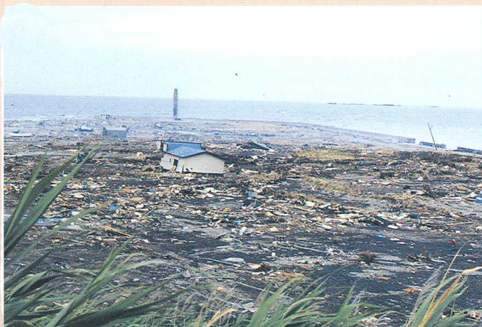
Devastation by tsunami at south end of Aonae community

The first attack of tsunami which was 10 m high, arrived from the west around five minutes after the shock. Most of the houses built on the south end of Aonae community were washed away and destroyed in an instant (photo right). The second surge coming along the east coast attacked the most densely built-up area on the east block of Aonae around eight minutes after the shock. The port break-seas guarding the centre part of the built-up area seemed to be effective in mitigating the force of the tsunami. Approximately 200 houses in the lower area of this community were protected from the violence of the surge. Unfortunately, however, most of the remaining houses were destroyed by the fire that developed later (photo below).