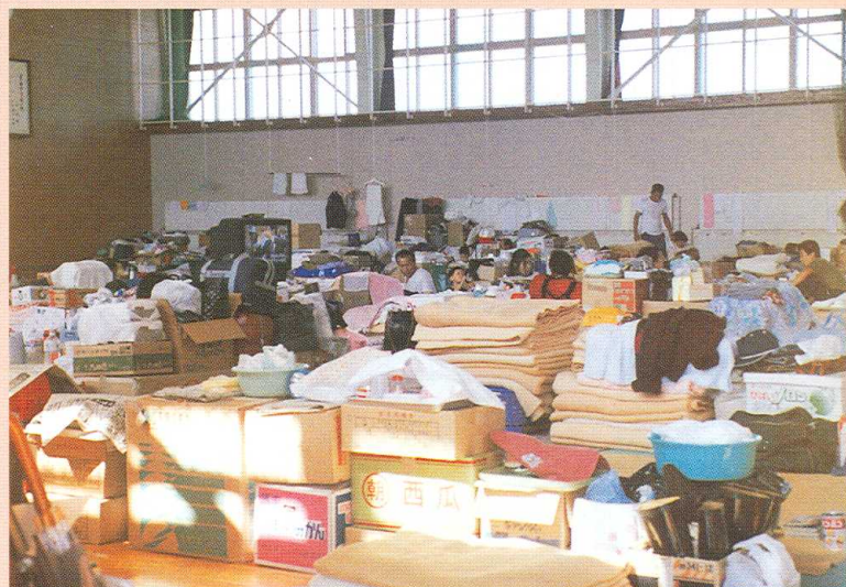
Gymnasium of Aonae Middle High School