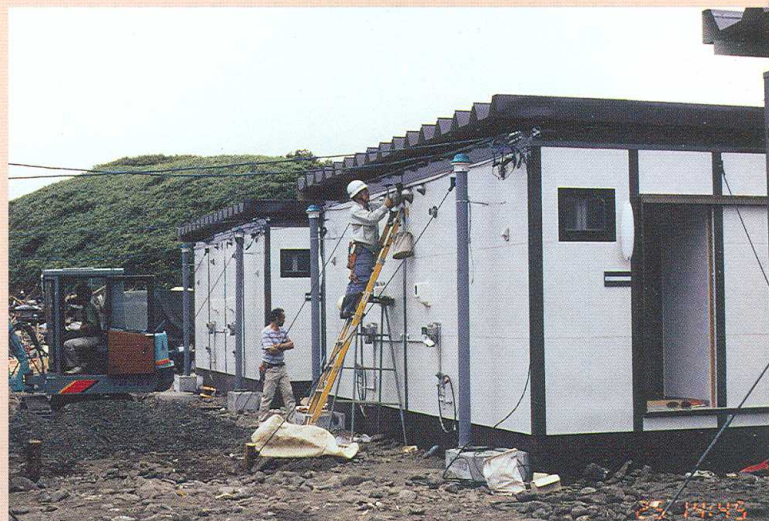
Temporary housing for the homeless