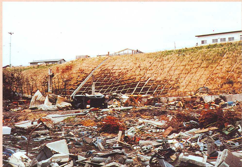
Staircases and evacuation routes