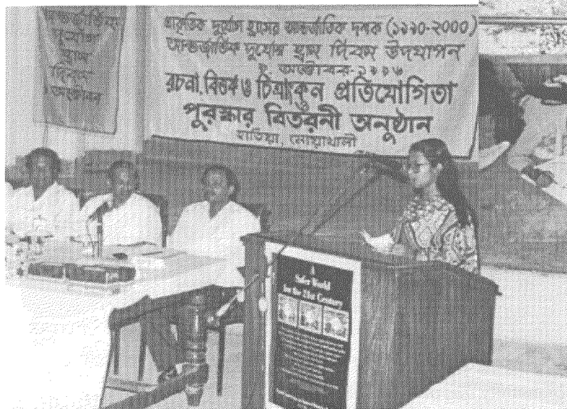
Hatiya, Bangladesh. School debate competition