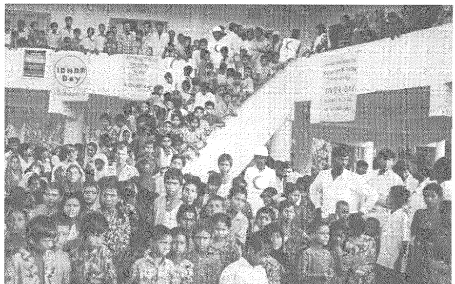
Hatiya, Bangladesh. Cyclone demonstration programme for evaluation of vulnerable people

The Ministry of Disaster Management and Relief (IDNDR National Committee), through its Disaster Management Bureau, concentrated its efforts on the megacity of Dhaka, (pop. 8 million) and on the island of Hatiya. They organized a meeting featuring the Secretary of the Ministry of Disaster