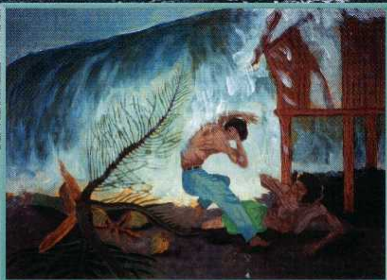
The Wave. Painting by Lucas Rawah of Aitape, done to commemorate the July 17, 1998, Papua New Guinea event. A magnitude 7.1 earthquake is thought to have triggered a submarine landslide generating a tsunami that destroyed entire villages along the Aitape coast.