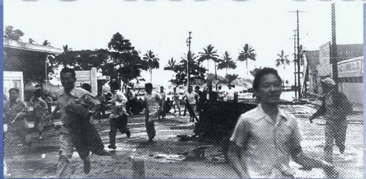
April 1, 1946. People flee as a tsunami attacks downtown Hilo, Hawaii