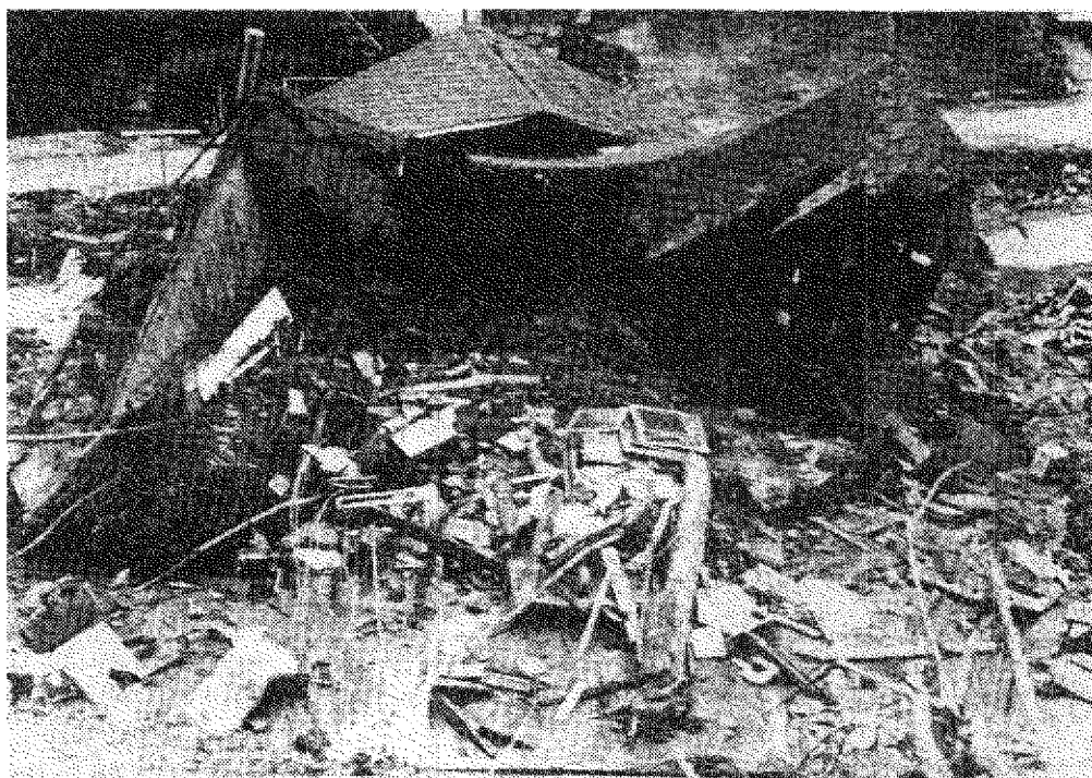
Figure 7. The remains of a house where three children died in a mudflow in Kanawha City, West Virginia. The movement was triggered by heavy rainfall from a cloud- burst on July 9, 1973 (Lessing et al., 1976).

Weathering is the natural process of rock deterioration which produces weak, landslide-prone materials. It is caused by the chemical action of air, water, plants, and bacteria and the physical