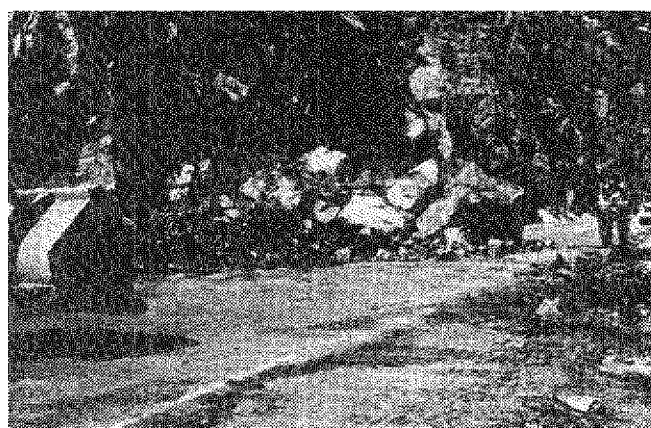
Figure 8b. Rockfall on U.S. Highway 6, Colorado.

separates from the main mass, falling to the slope below, and subsequently bouncing or rolling down the slope (Figures 9a, b).