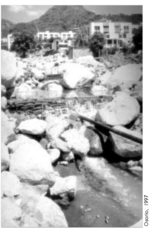
Water system authorities should take emergency measures to ensure that the population has a safe and reliable source of drinking water in case of disaster.