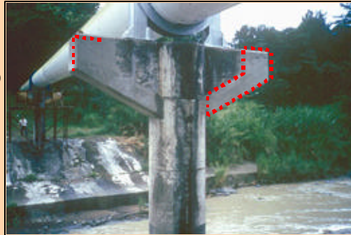
Execution of mitigation measures