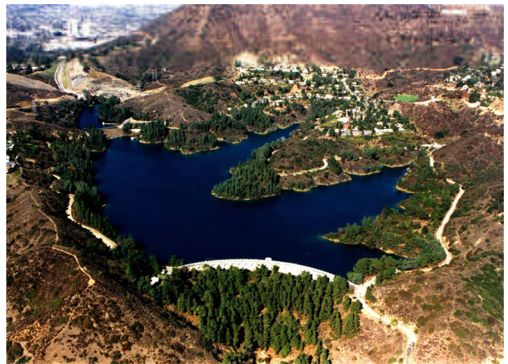
10 Reservoir