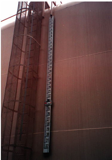
7 Tank Water Level Indicator