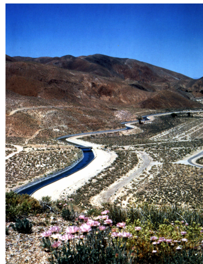
12 Aqueduct near hills