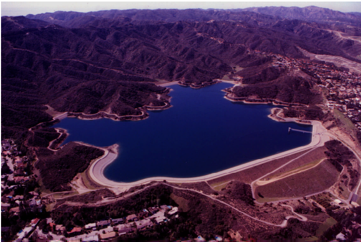
9 Reservoir