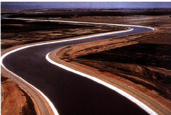
11 Aqueduct, valley location