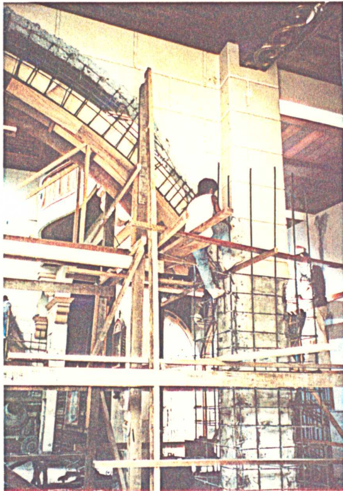
Photo 4.35 Basilica of Our Lady of Charity at Agoa, built as r.c. structure, damaged. Strengthening of the r.c. columns with jackets through foundations and new arches for increase of stiffness in the longitudinal direction.