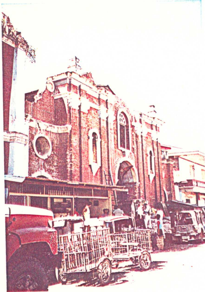
Photo 4.36 Damaged brick masonry - Church of Dagupan. The church was in poor structural conditions prior to the earthquake with extensive settlement cracks.