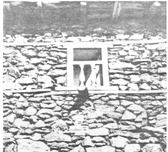
Stone masonry with reinforcement in Xalkidiki (23)