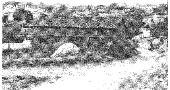
Well constructed adobes experienced no damage at all