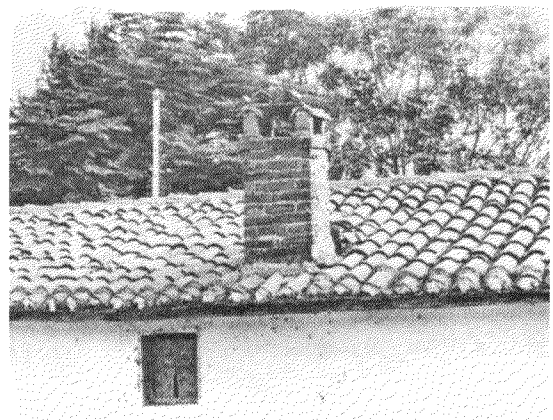
FIG.11 Well constructed stone masonries w/o mortar, and traditional chimney in the epicentral area of the Volvi 06.20.78 EQ. Many of them experienced no damage at all