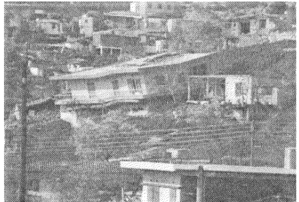
FIG.15 Modest brick masonry structure with light R.C. roof experienced no damage, while surrounding structures with mixed construction systems collapsed during the Alkyonides 03.4.81 EQ