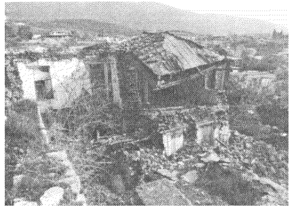
FIG.14 Traditional Construction Systems (Tsatma, Stone Masonry) of poor construction and/or maintenance experienced severe damage during recent EQs