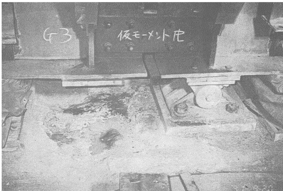
(a) Removal of Existing Bearings