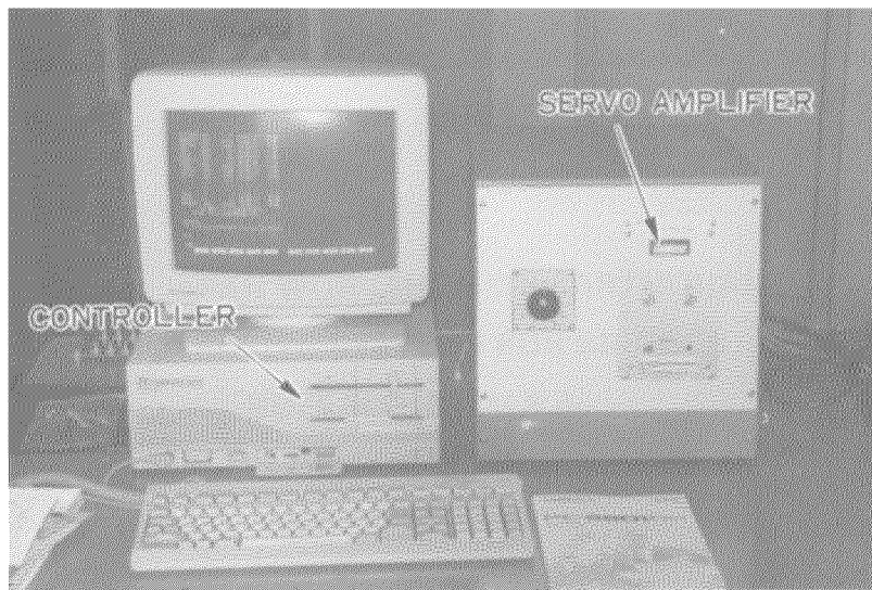
Photo 9 Control System for Variable Damper