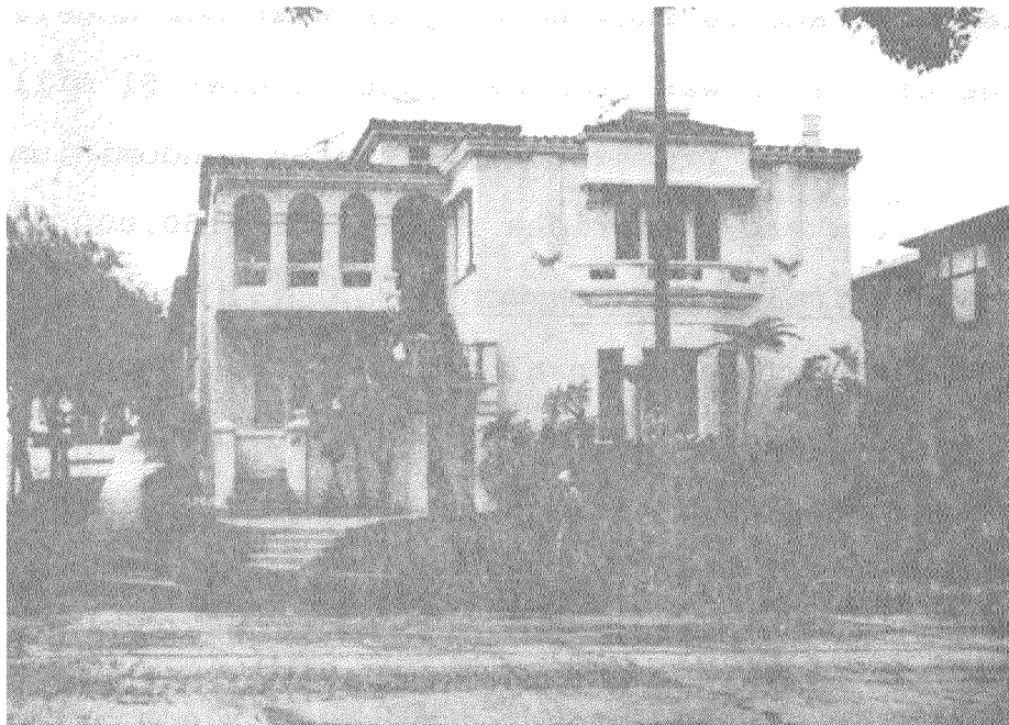
Well-maintained, expensive housing is depicted in Photographs 19 and 20. Average housing costs here are $250,000 and range to over $1 million.