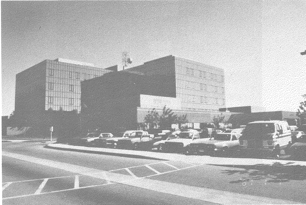
Fig. 34 General view of the Olive View Medical Center.