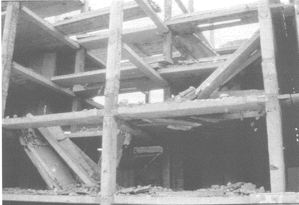
Fig. 6 (a) Collapse of a precast-concrete frame structure due to failure of poorly-connected precast elements