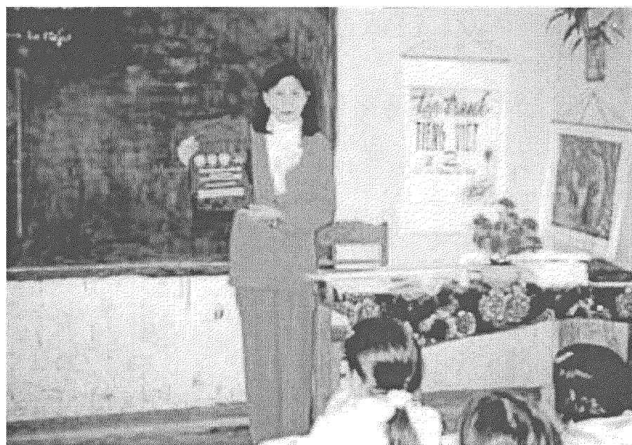
Training of school children, Vietnam

The new Disaster Management project builds on the success of a previous UNDP project that established a nationwide water disaster information and monitoring system focused at the provincial level that extends training in disaster awareness and response right down to the district and commune levels. The new project is extending this water disaster management capability to other disasters, including drought, seawater intrusion, and forest fires.