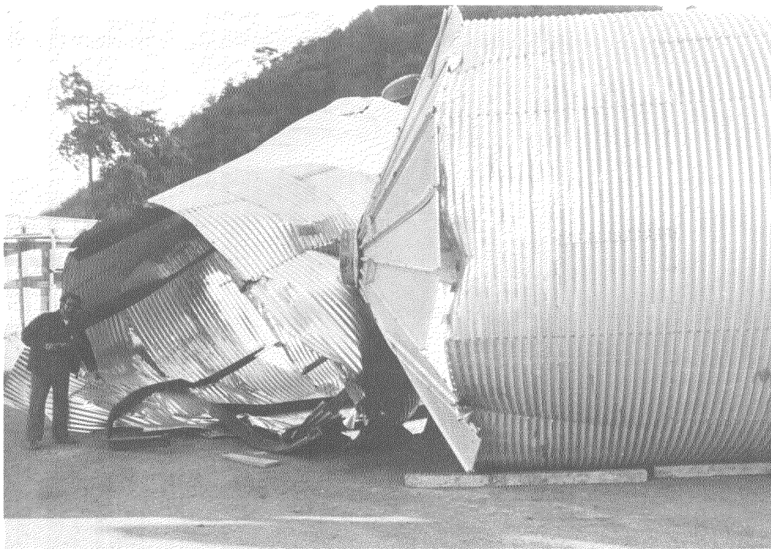
FIGURE 60.—Collapse of a corrugated-steel grain silo in Villalobos, 5 km southeast of Guatemala City