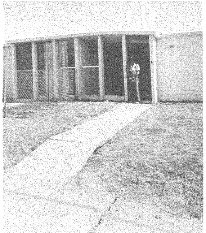
FIGURE 62.—Severe damage to reinforced-masonry construction caused by secondary faulting in Colonia San Francisco (Zone 19). The fault strikes north to northeast.