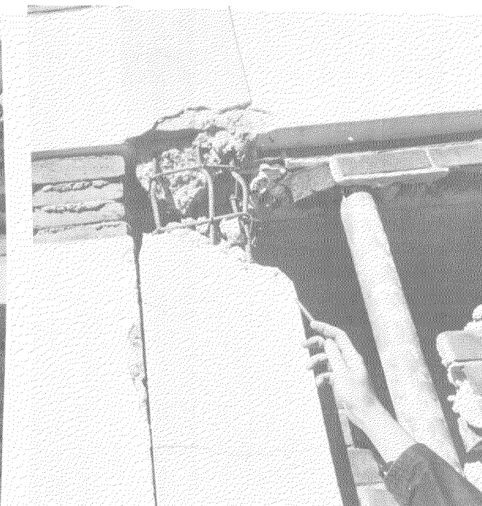
FIGURE 66.—Failure of short column in three-story framed reinforced-concrete structure in Guatemala City (Zone 7).