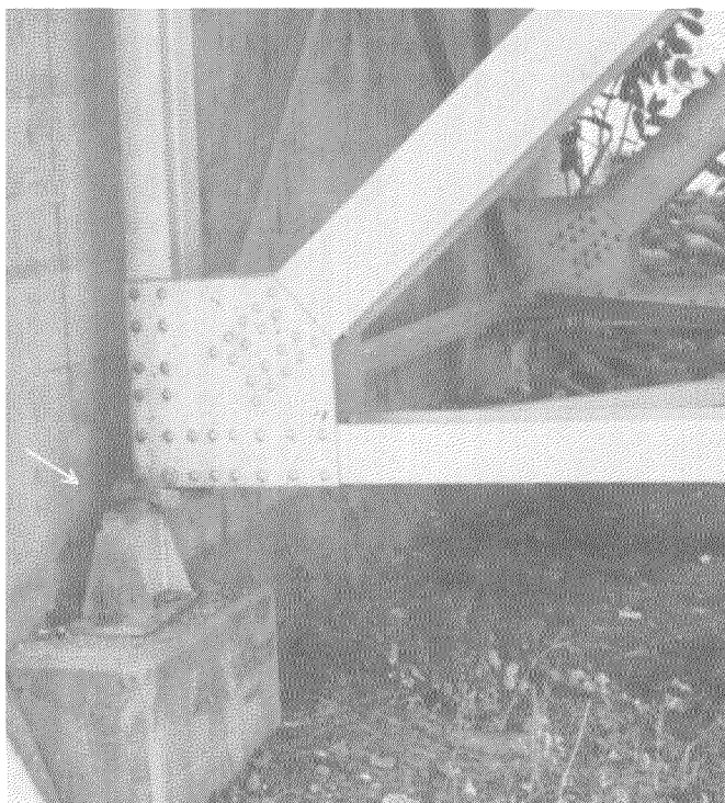
FIGURE 65.—Benque Viejo Bridge, on the verge of collapse after failure of supports, shown by arrow.