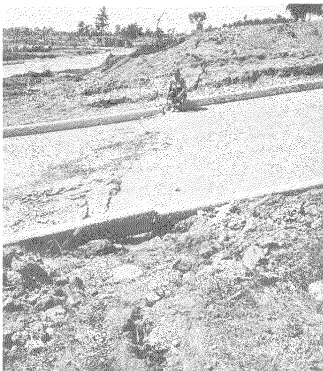
FIGURE 63.—Rupture across the San José Rosario subdivision Fault with 13 cm vertical and 5 cm right-lateral displacements (Zone 19)