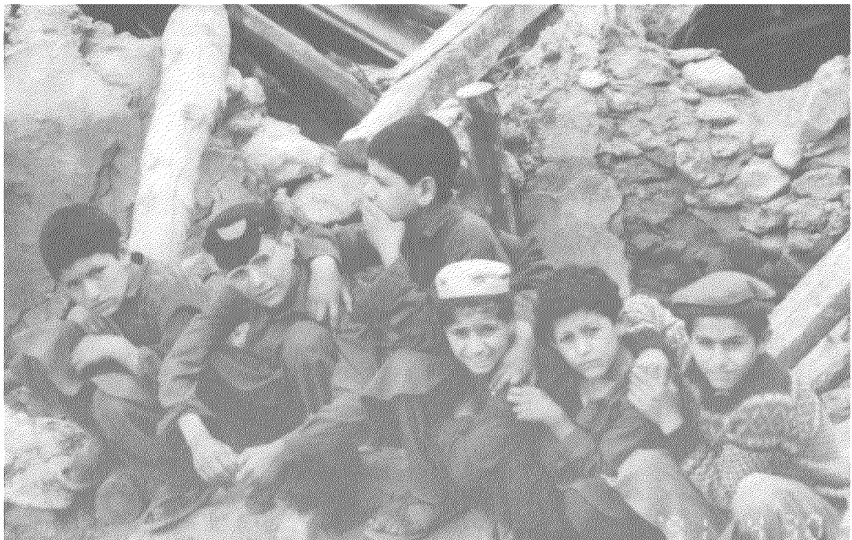
Hindukush Earthquake, Pakistan and Afghanistan, February 1991

The financial and administrative plan for the WSSI is based on increasing worldwide resources for earthquake engineering research and practice improvement activities. The WSSI will expand the resources available by developing new funding sources, and will not reallocate financial resources from other earthquake engineering activities.