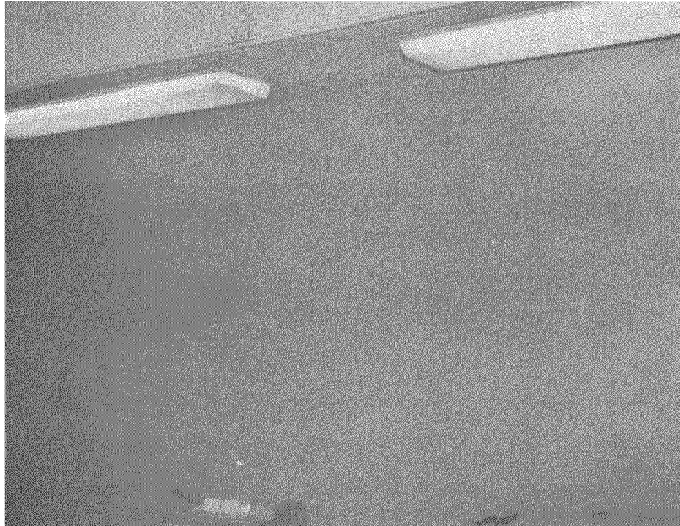
Fig. 7.39 Pattern of X cracks in 10 inch thick R/C shear wall at east end of first story of Administration Building, Delco Electronics facilities.