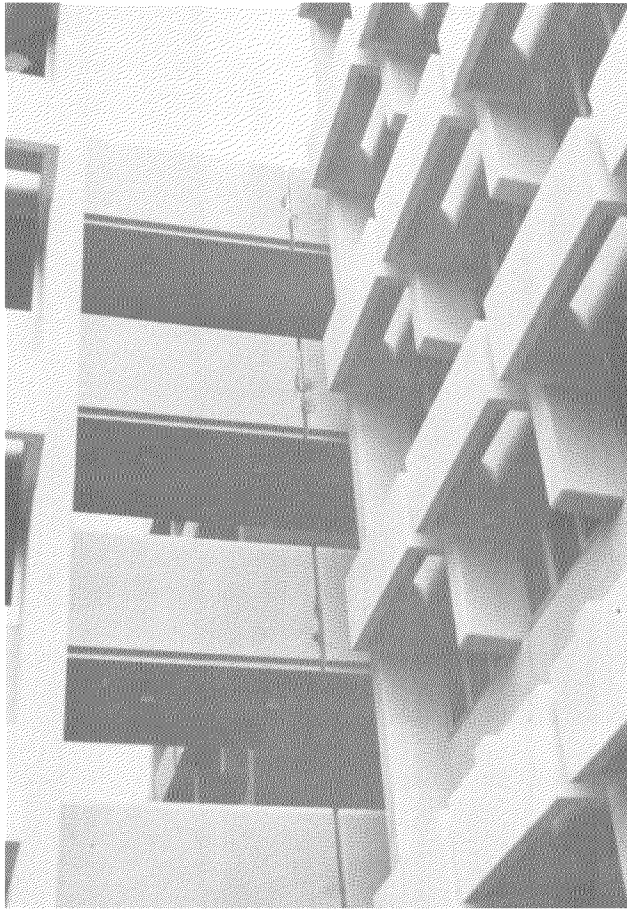
Fig. 11.5 Damage to seismic joints on third through sixth floor walkways between South Hall and the Graduate Tower, UCSB campus.