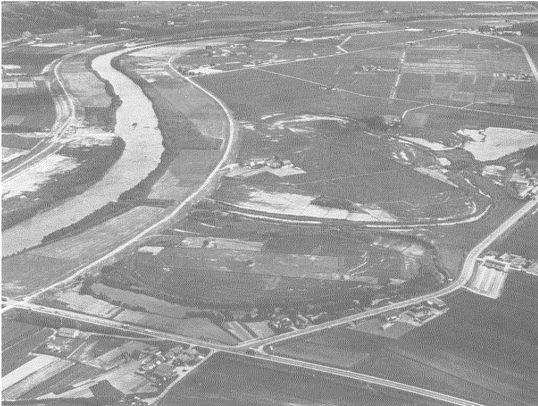
Photo 3 Aerial View of Aichi Area from Downstream of Shinei Bridge (Area D and E, see Fig.4)