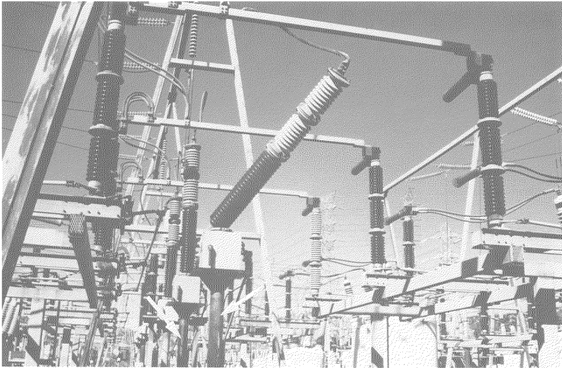
Fig. 6 Discoloration of Support Columns Indicates That Two CVTs Have Failed.