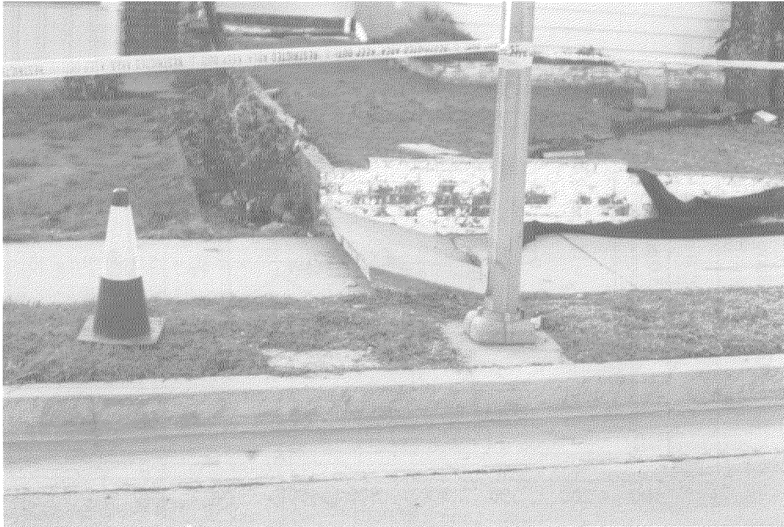
Figure 6 Sidewalk Overlap on West Side of Balboa Blvd., Southern End of PGD Zone