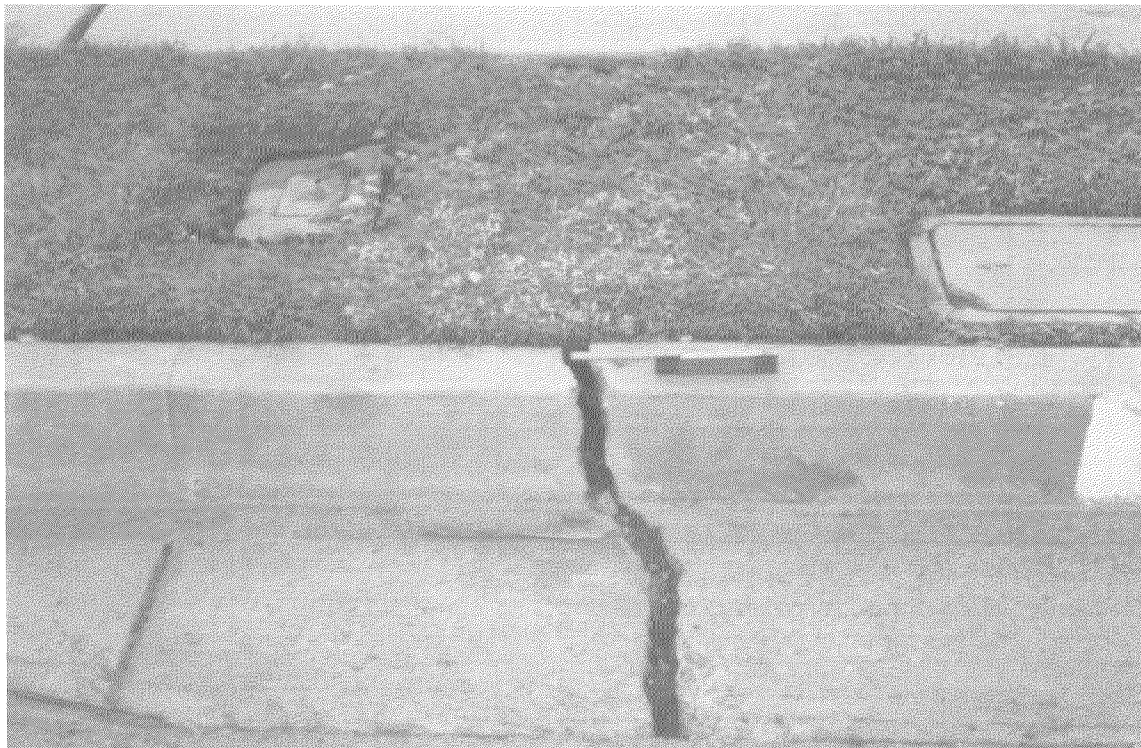
Figure 7 Gap in Curb on West Side of Balboa Blvd., Northern End of PGD Zone