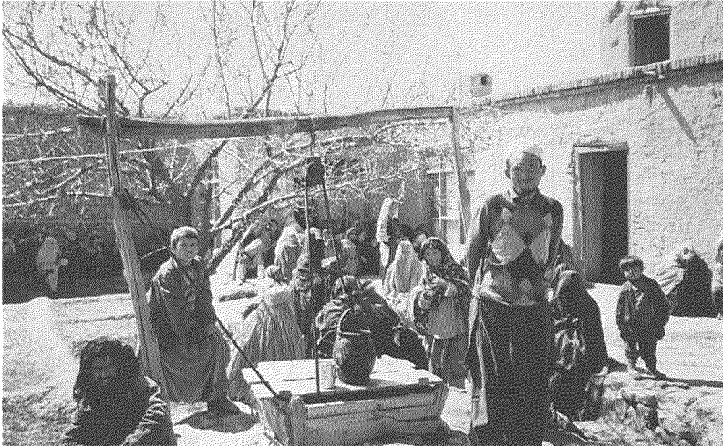
Kabul, Afghanistan. A protected well, chlorinated by a health worker, as a means of ensuring safe drinking water to one of the densely populated sections of the capital. (WHO)