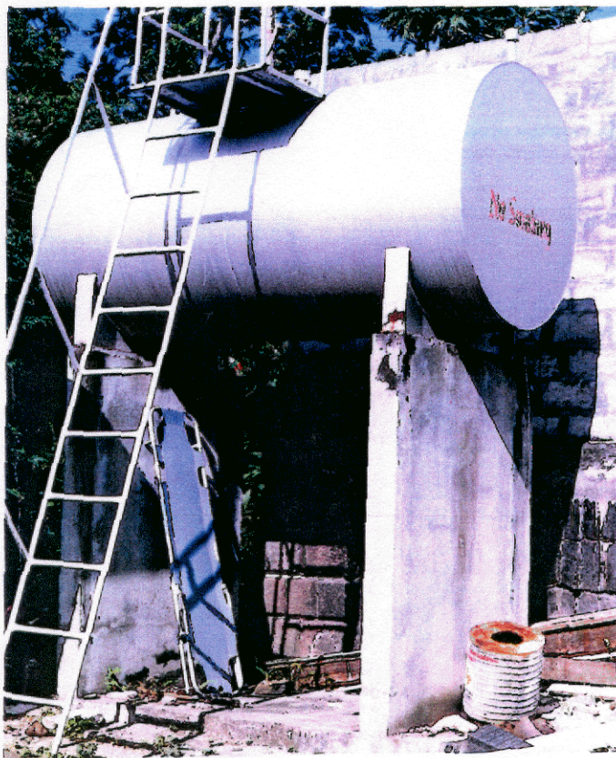
PHOTO 49 GASOIL STORAGE TANK AT CREMATION PLANT