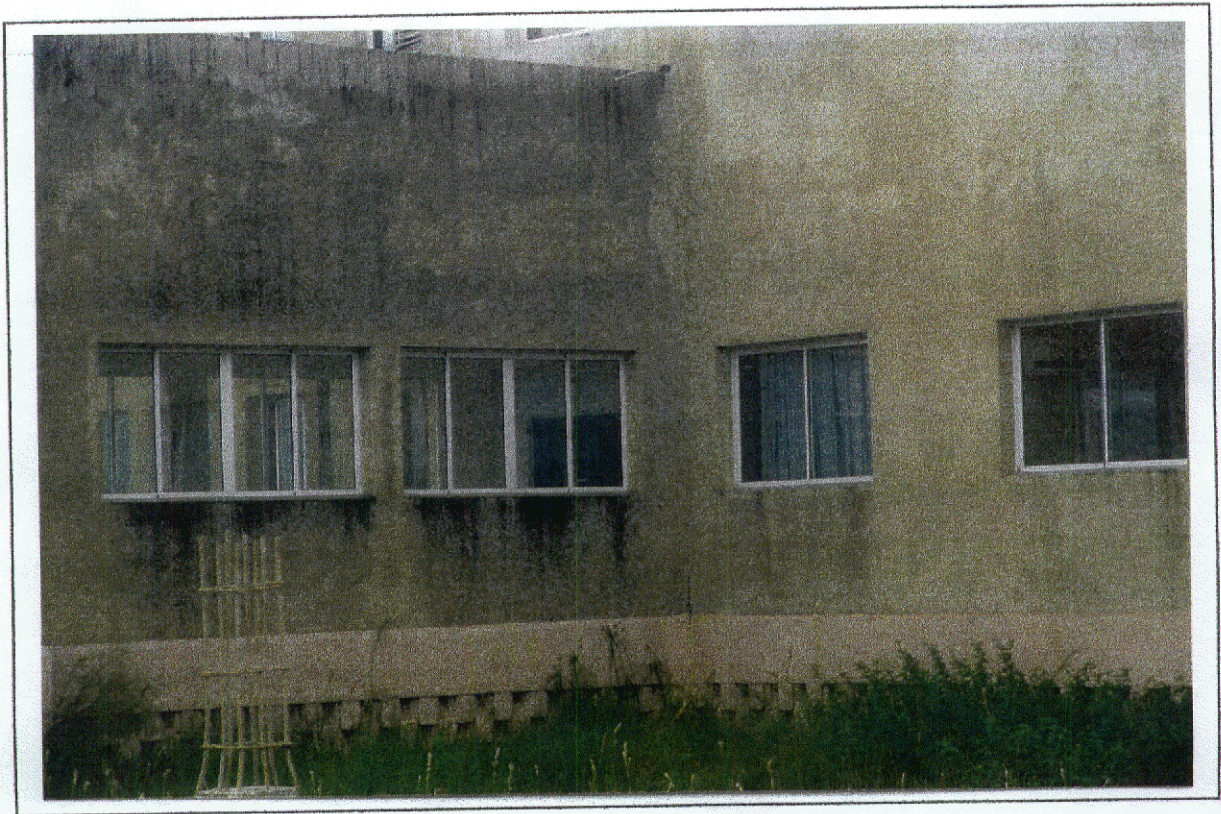
Photo 21 - External wall of the Hospital