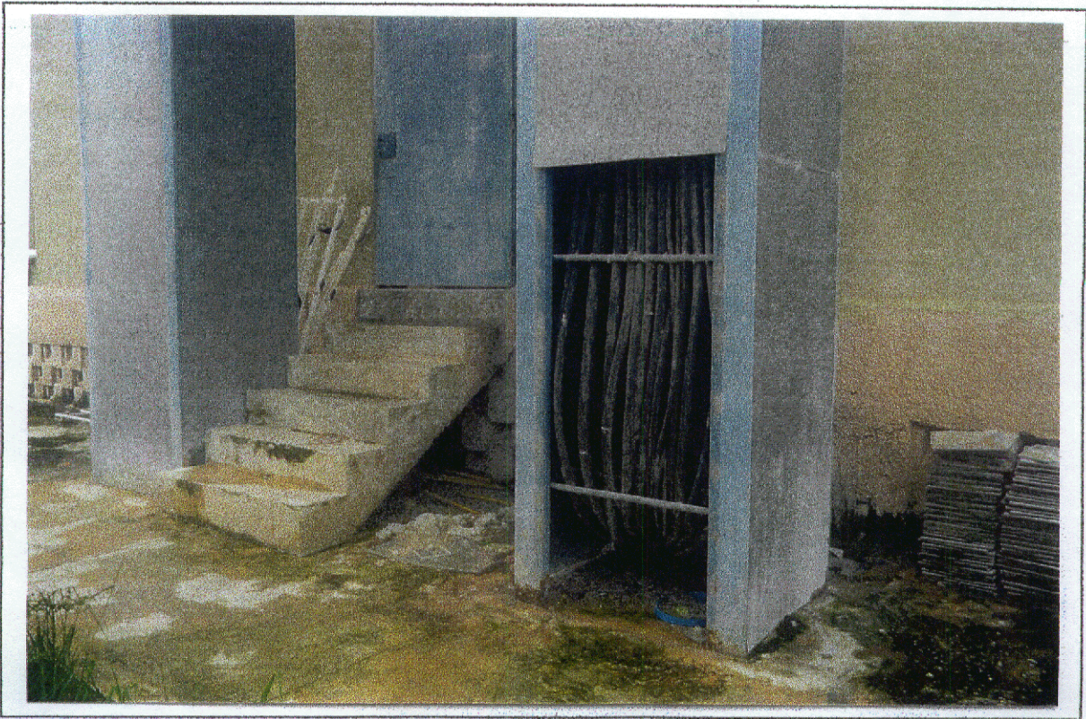
Photo 23 - Electrical Cable Duct

Metal panels (covers) removed by sub-hurricane winds