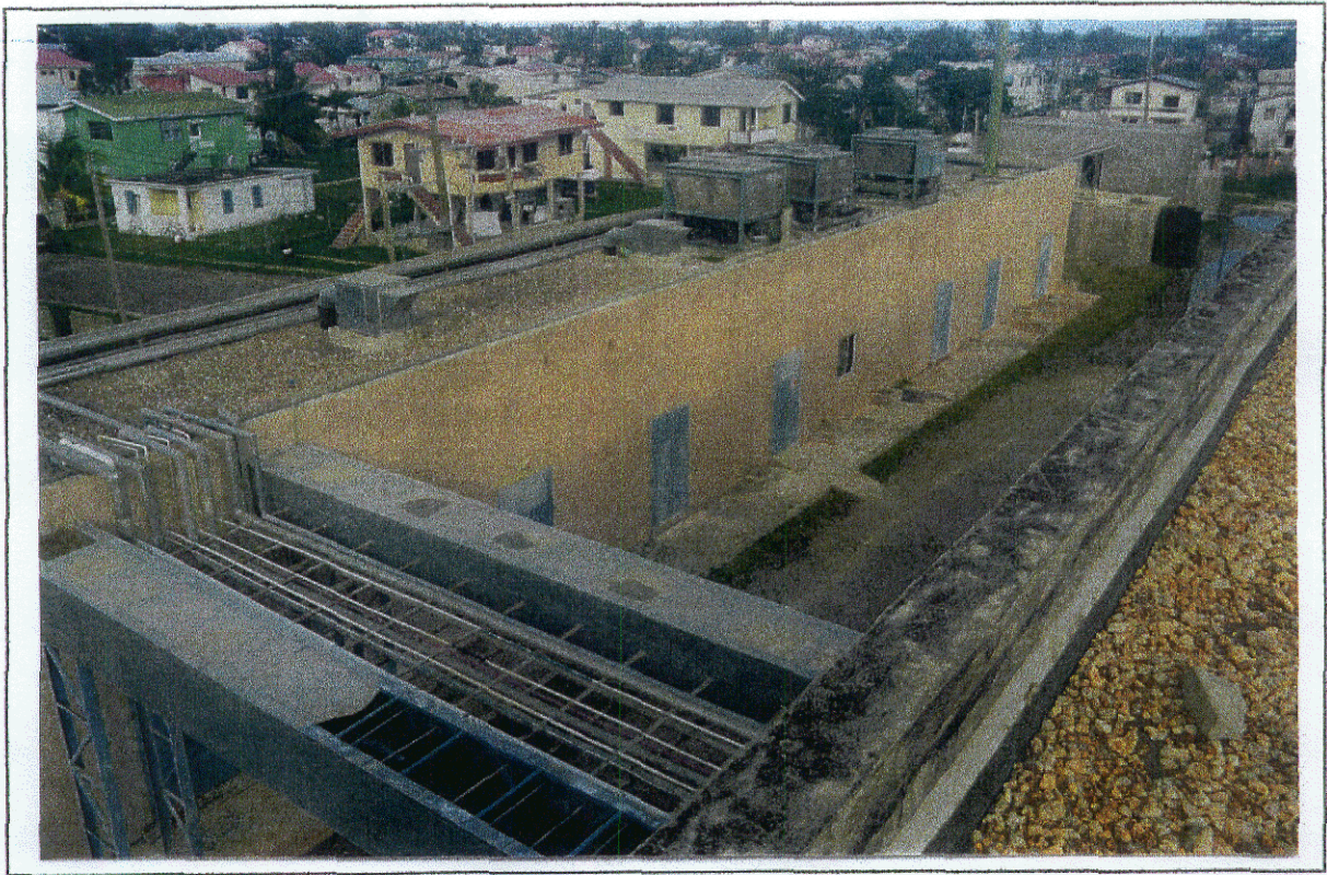
Photo 25 - The Utilities Block