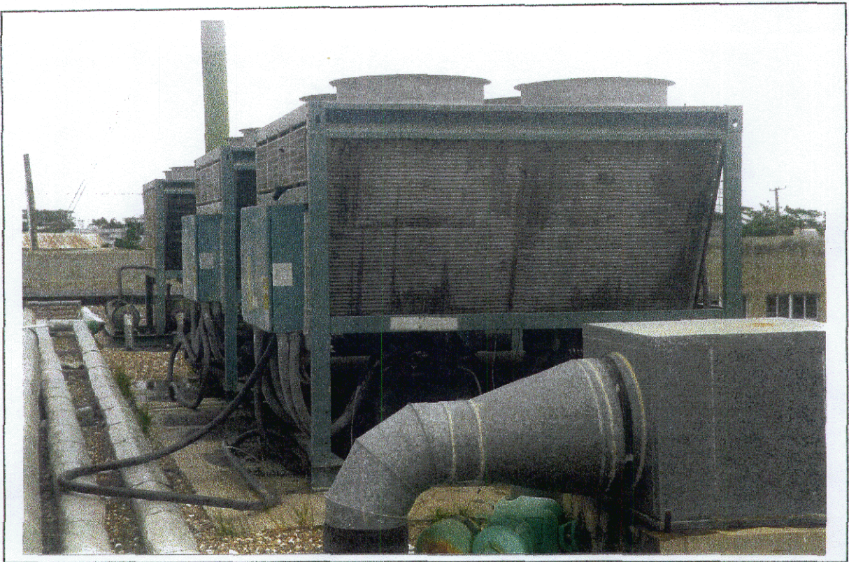
Photo 29 - Airconditioning Plant on the roof of the Utilities Block