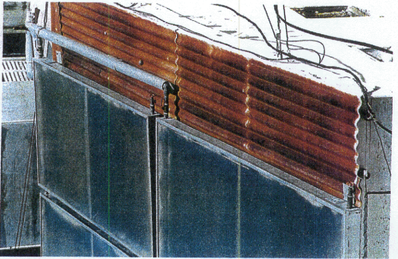
Photo 22: Solar heating panels on kitchen roof. Note inadequate fixing of panels to roof sheeting.