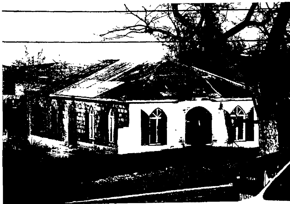
Chapel - substantial damage to roofing