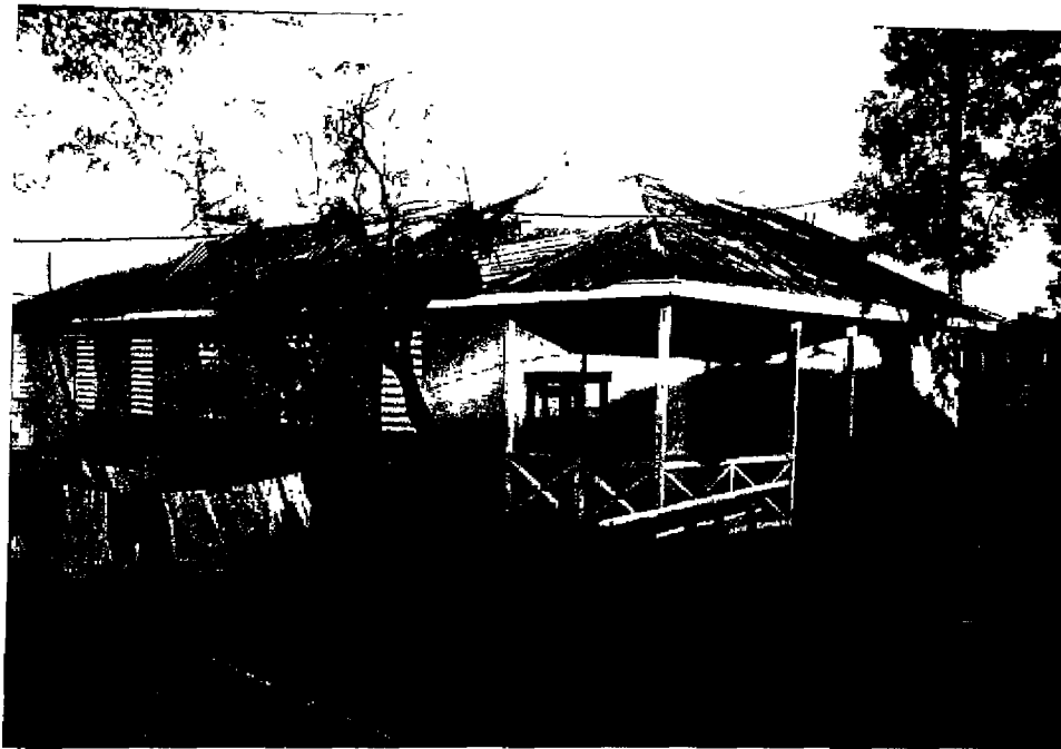
Male Ward - damage to roofing.