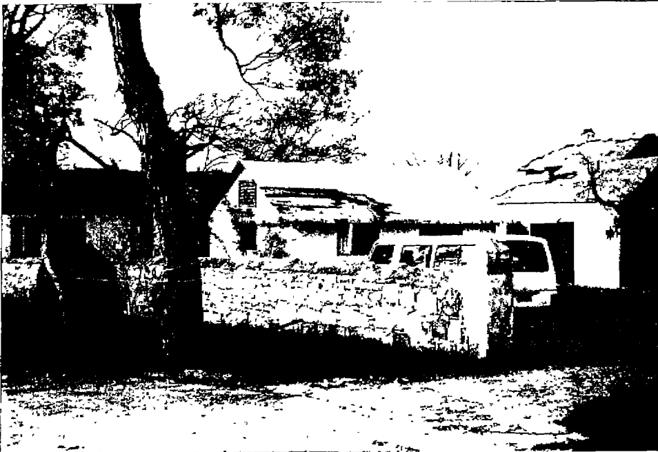
Mental Hospital - loss of asphalt roof shingles.