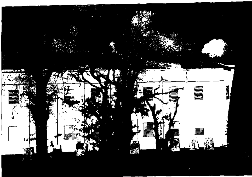
Blackburne Ward - loss of light-weight roof over original concrete roof slab.