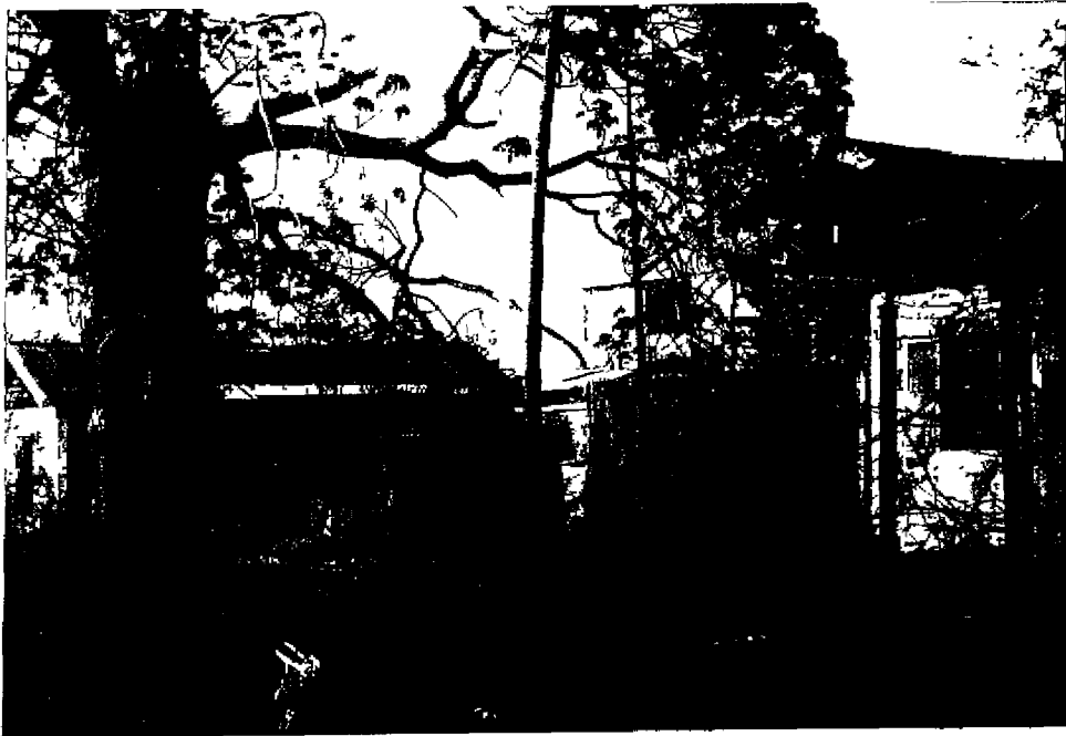
Mental Hospital - loss of corrugated metal roofing.