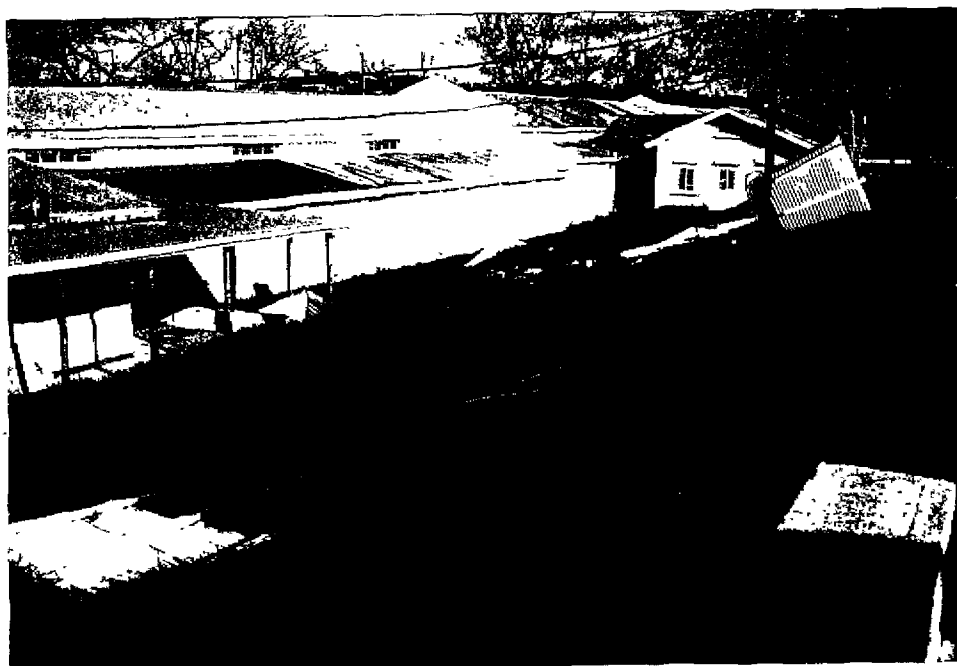
Walkway adjacent to kitchen - destruction of roof.