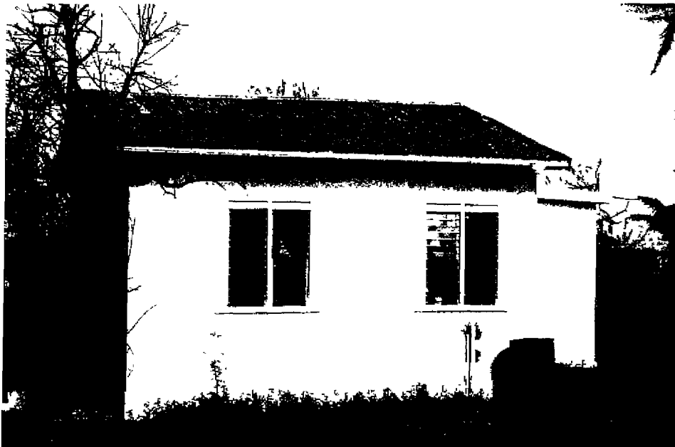
Pares - recent repairs were done to the roof.