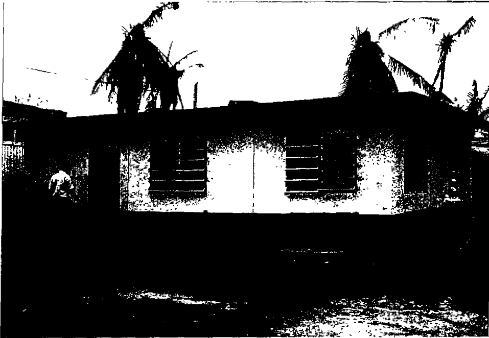
Parham - undamaged clinic with reinforced concrete roof.