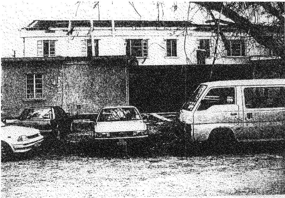
St John's - destruction of roof.