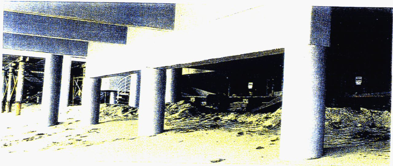
Completed beam and column application in Malibu, California.