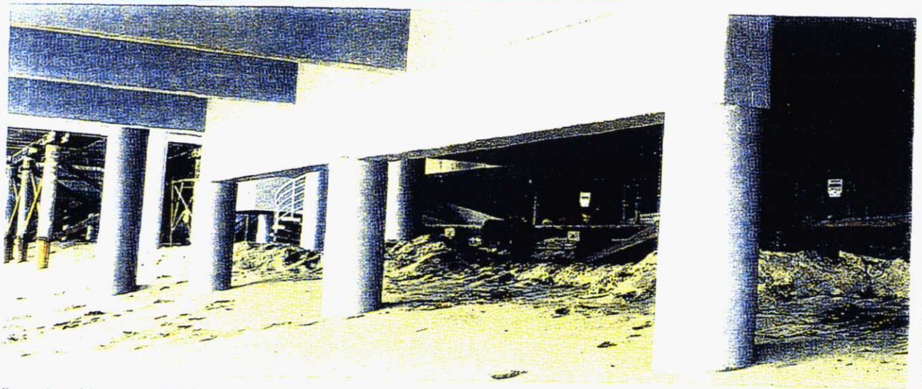
Completed beam and column application in Malibu, California