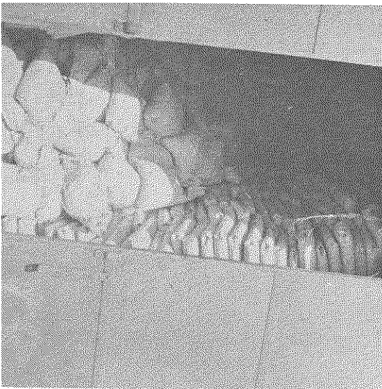
CORN-SOY MILK DONATED BY THE UNITED STATES WHICH HAD ALREADY BEEN STORED IN THIS WAREHOUSE IN ROSSO FOR 3 MONTHS AT THE TIME OF OUR VISIT IN NOVEMBER 1974.