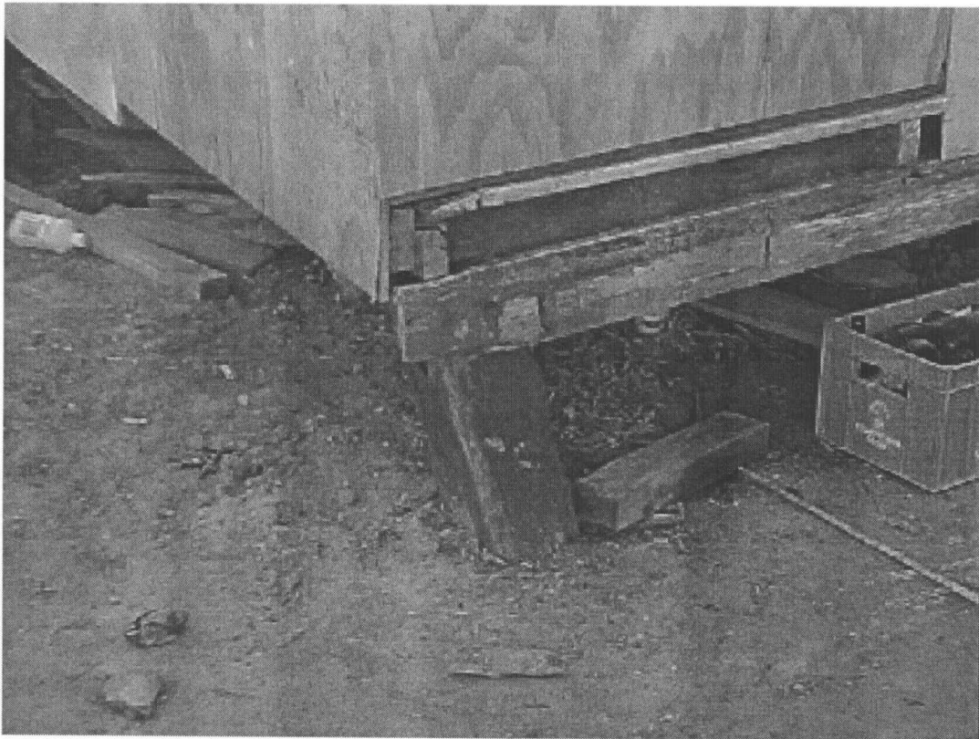
7. San Pedrito, Ambergris Caye: House was displaced from its foundation by water and windforce.