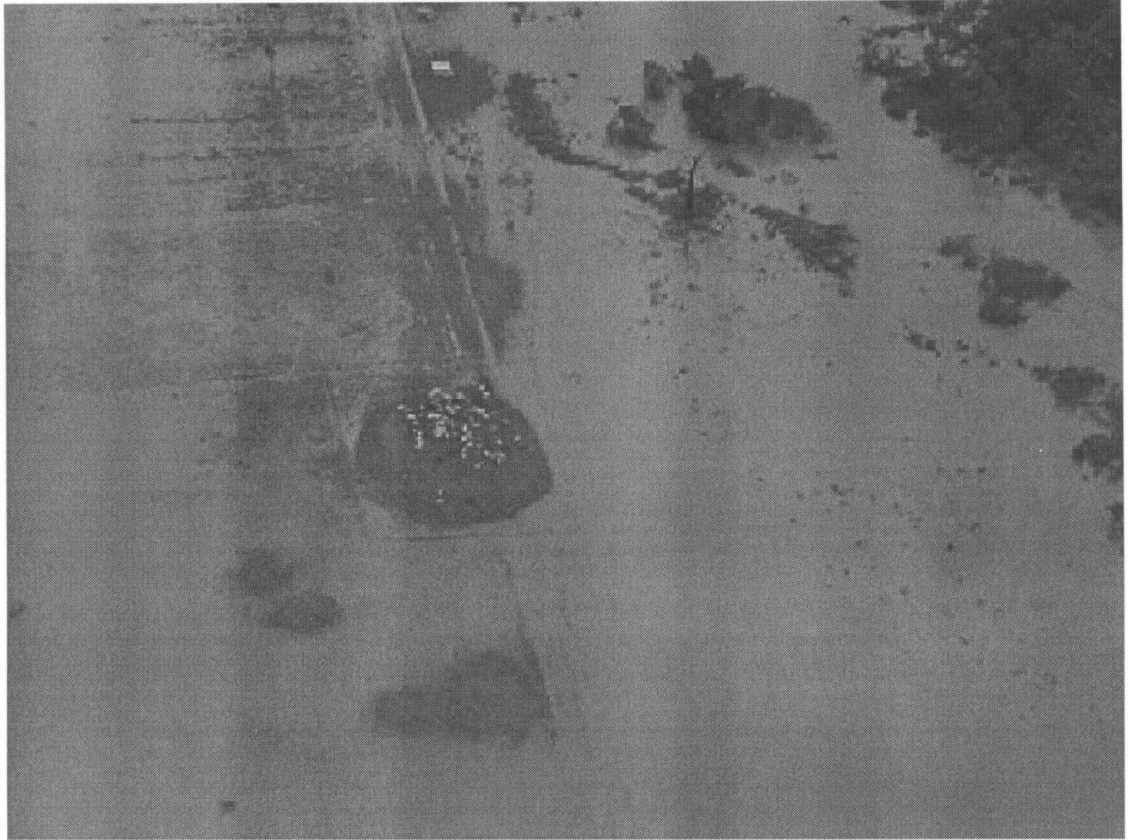
4. Cattle stranded in flooded pastures