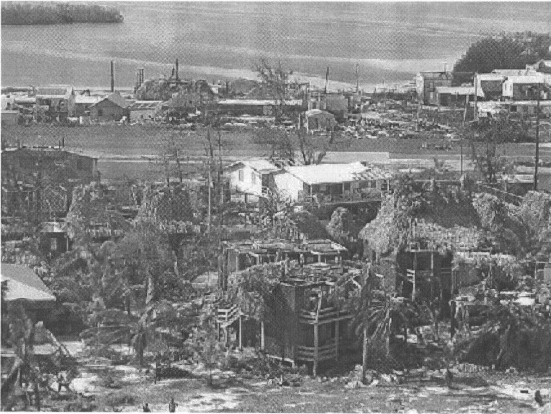
6. San Pedro in Ambergris Caye