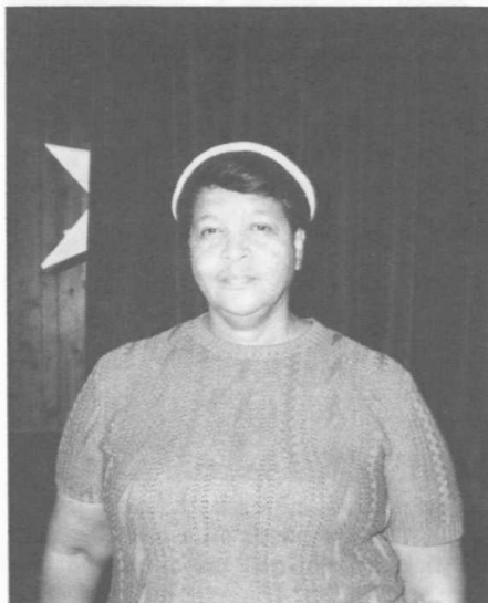
Church World Service

Churches, which bring together a diversity of people, offer an ideal setting for a community to explore its disaster risks.