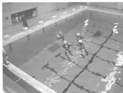
(Training of Hyper Rescue Team)