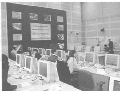
(Ministry of Land, Infrastructure and Transport)

This module was very important, as trainees were able to learn Japan's disaster management including the Tachikawa Disaster Management Facility, which functions when the capital of Japan is destroyed by a big disaster.