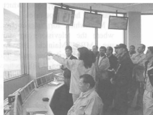
(Restoration Office of Unzen Volcano)