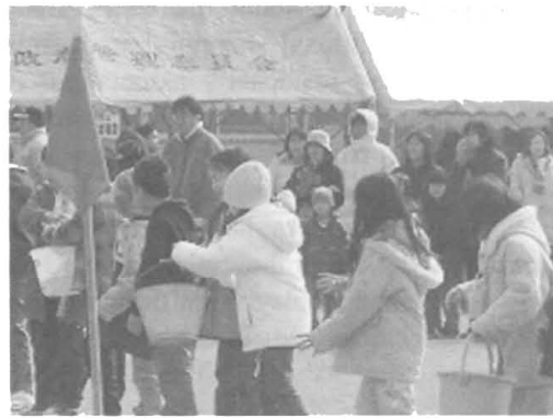
(Emergency Drills in Elementary School)

To see the example of disaster education in schools, they attended the evacuation drills in Nishinomiya City Kitashukugawa Elementary School. This evacuation drills were conducted not only by the elementary school but also the kindergarden and the Nishinomiya Fire Fighting Station, Nishinomiya Police Station, and voluntary organizations for disaster management, etc.