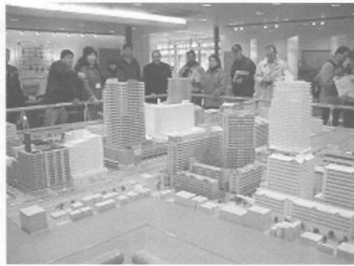
(Model of Redevelopment Plan)

Trainees have seen the various examples to know how the private sector and mass media play significant roles in times of large-scale disasters.