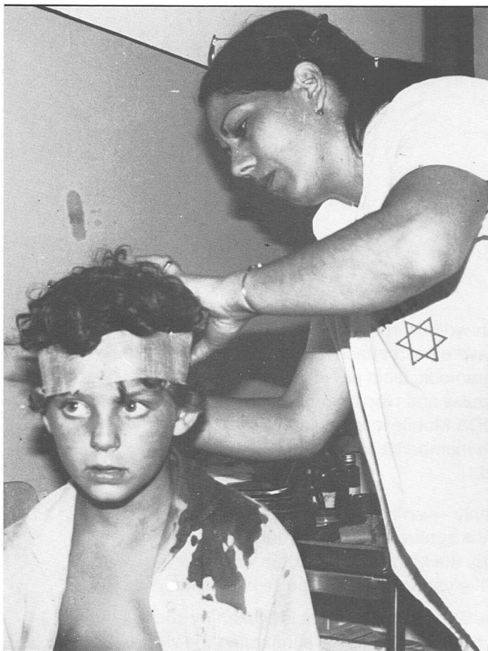
▲ Young accident victim receives First Aid at MDA Station in Akko