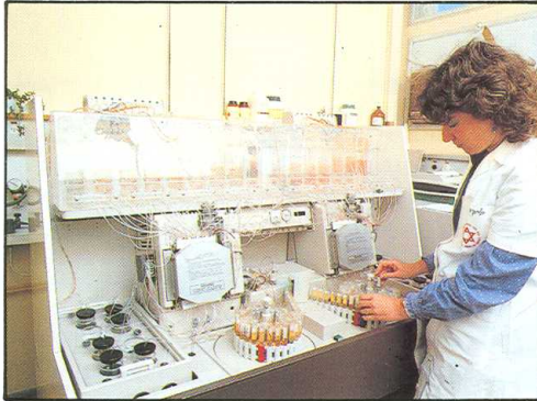
▲ Blood donations are sorted at Central Blood Bank by automated typing apparatus —