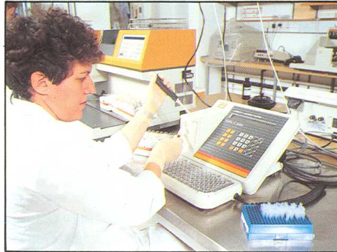
▲ — and are then tested and screened by the ELISA System to ensure that they are free of hepatitis and AIDS carriers