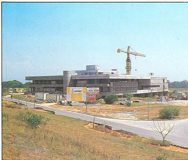
◀ The new National Blood Services Center of Magen David Adom, now under construction, is scheduled for completion in the Spring of 1987