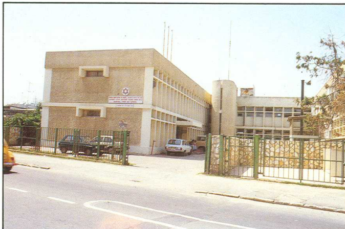
◀ The MDA Central First Aid School in Jaffa

MDA's extensive training program brings the ultimate goal ever closer: a First Aider in every home in Israel.