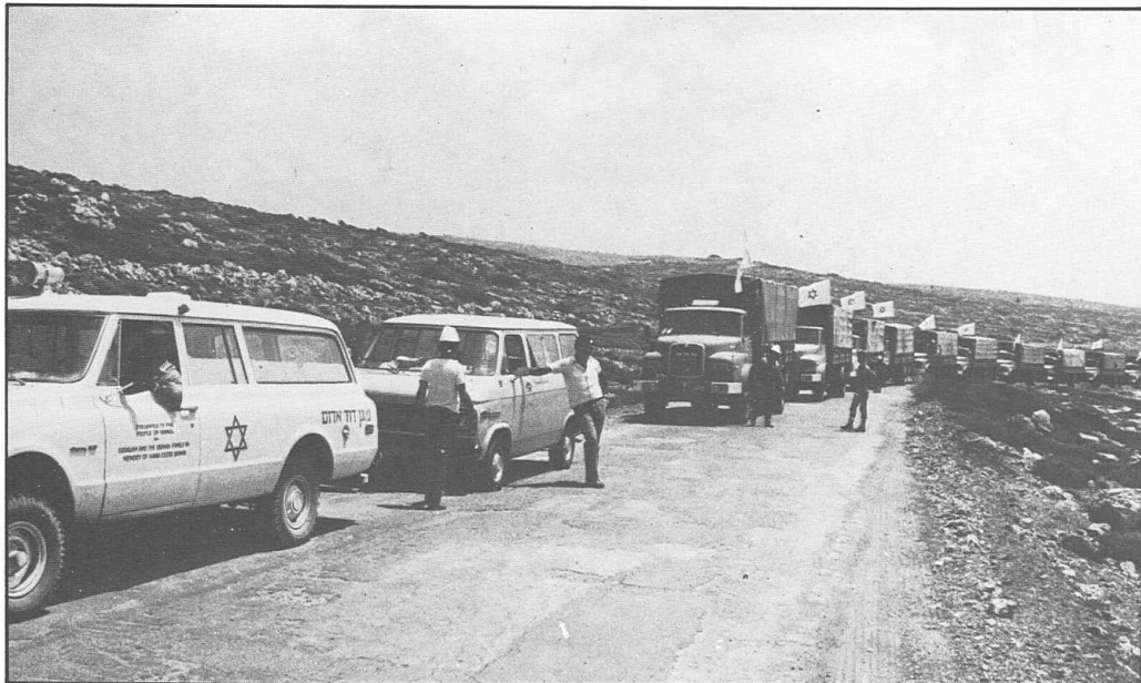
MDA truck and ambulance convoys carry medical supplies, clothing and blankets in the wake of Operation 'Peace for Galilee' — the gift of the people of Israel for the civilian population of Lebanon ▼