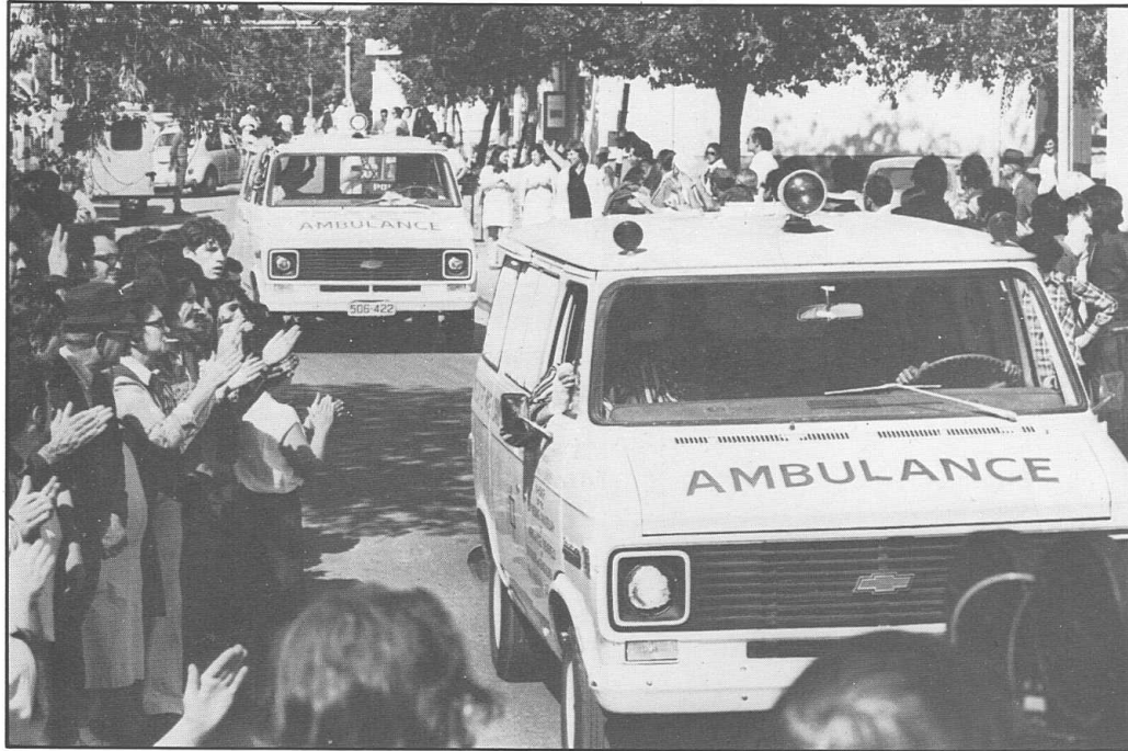
▲ Wounded Israeli prisoners of war returning home after Yom Kippur War are transported to hospital by MDA ambulances

human suffering wherever it may be found, to protect life and health, and to ensure respect for the human being.