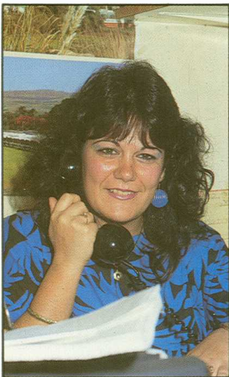
MDA Volunteers and Staff Members

MDA's Youth Volunteers work also with the elderly and infirm, visiting them and caring for their needs. They help new immigrants to over-