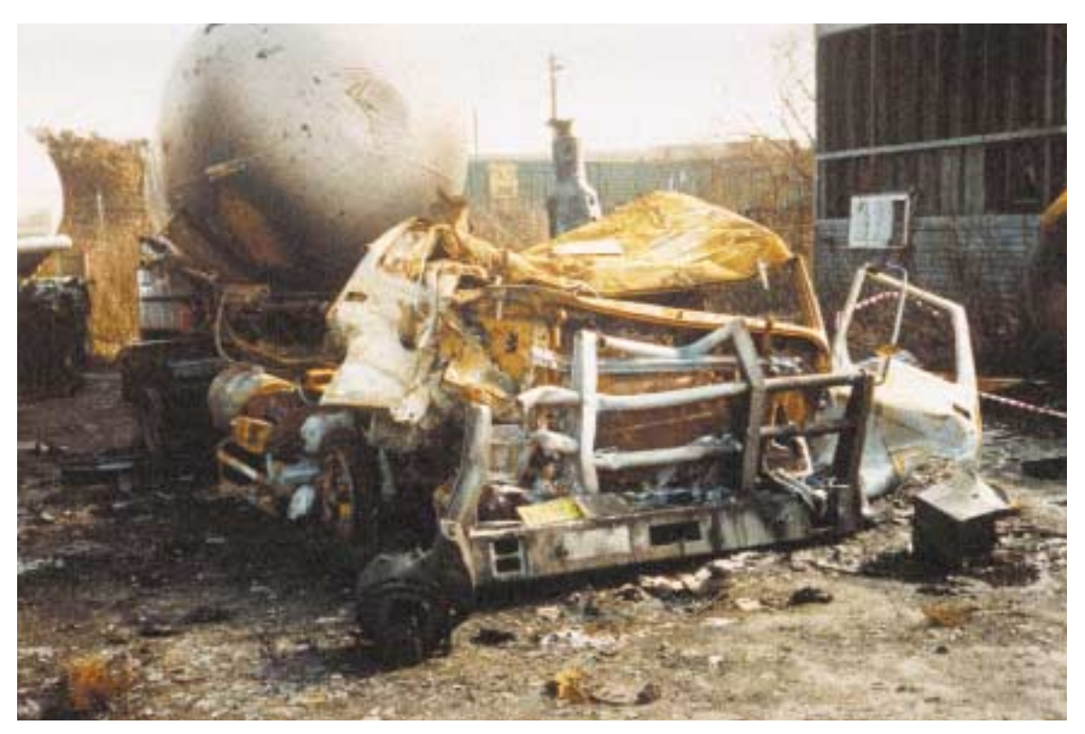
At each focus group, questions addressing risk perception and a local road accident scenario involving bulk dangerous good transport provided the catalysts for discussion.