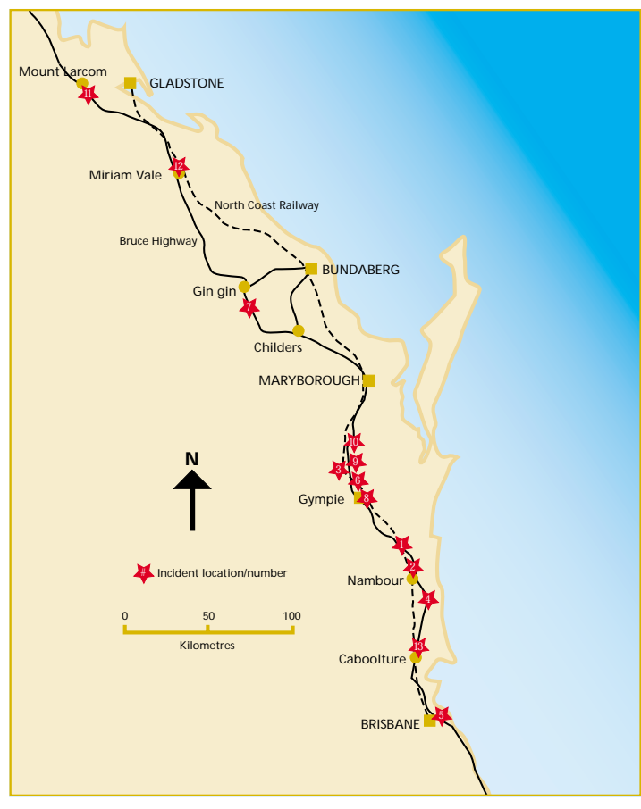
Map 1: The Brisbane-Gladstone Transport Corridor. Refer to Childs et. al. (2001) Table 1 for incident details.