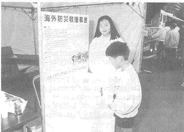
<Fund Raising Corner at Disaster Prevention Festival>

Donations will be sent to the Philippines Red Cross from the Japanese Red Cross Society for disaster countermeasure projects