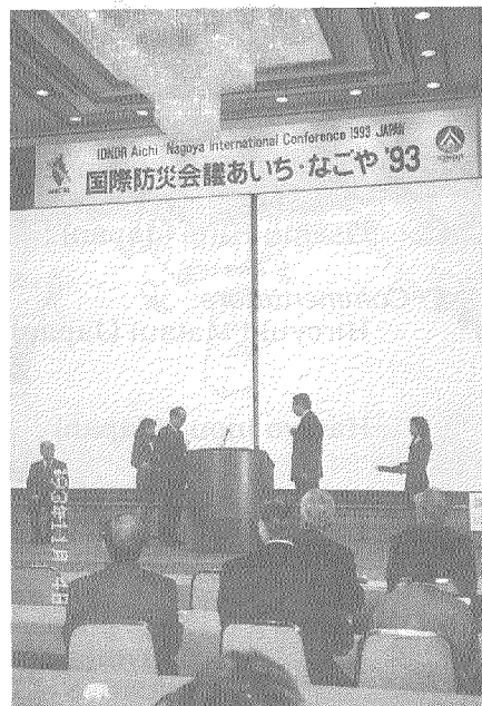
<Donation Presentation Ceremony>