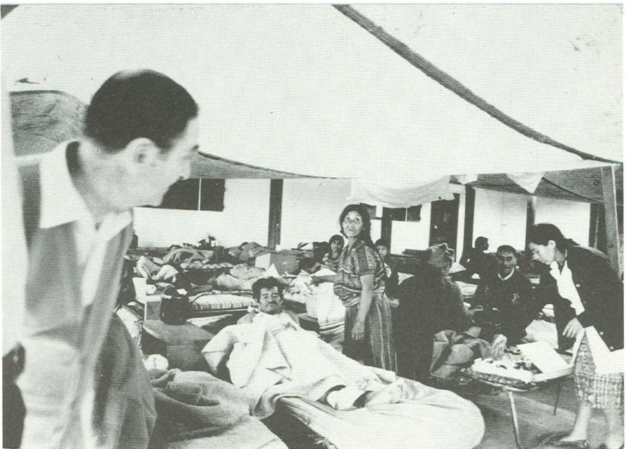
Lower photo — Undersecretary General Berkol visits Behrhorst clinic