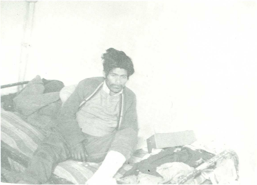
Upper photo — patient at Behrhorst Clinic